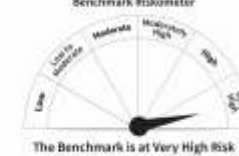
Scheme Benchmark: Nifty Next 50 Index (TRI) Benchmark Riskometer

Investors understand that their principal will be at Very High Risk.